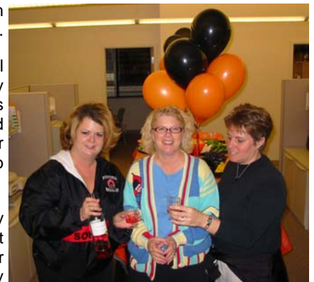
OUR 1ST PLACE WINNERS Scavenger Hunt: 2005