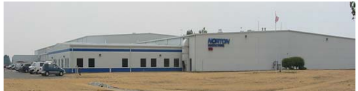
Norton Manufacturing's expanded facility on SR 12 east.

In lieu of all of the talk of economic downturn and constant news of historical changes on Wall Street, Fostoria has seen and is still experiencing growth. Norton is near completion on its 150,000 foot expansion at its route 12 facility. InterMetro has added 5,400 square feet of additional storage space and will add 3 new positions with the possibility of more. In addition to the expansion InterMetro has invested $2 to $2.5 million in new equipment. Along with the reinvestments a new facility, POET biorefining, will host a grand opening on September 30.